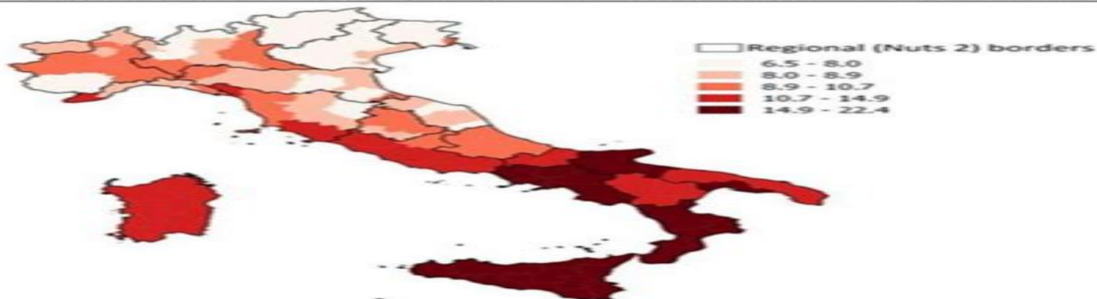
Fig. 4c. Proportion of households potentially suffering economic hardship (c)