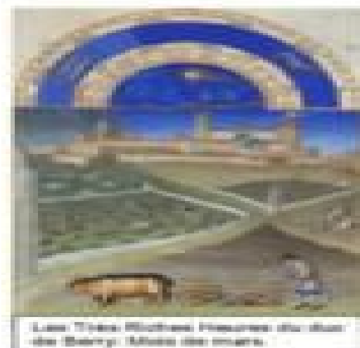
Les Trois Riches Heures du duc de Berry. Musée de la ville de Paris.

L'art du paysage n'apparaît vraiment qu'au début du 16 e siècle lorsque des artistes accordent au paysage la place principale dans leurs compositions. Le sujet du tableau reste en général religieux ou historique et des personnages apparaissent toujours. Mais le peintre a pour ambition de peindre un vaste paysage en y