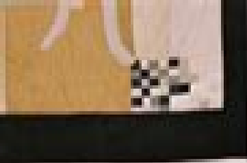
Plate 24. "Bridget Quilt" by Doris McMahon May; 76" by 90". Combining here are the elements of a traditional quilt with the photographic image in the approach of contemporary painting.