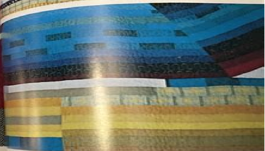
Plate 16b (below) Detail, Dialogue