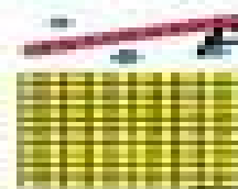
diagram Act out the problem or use objects