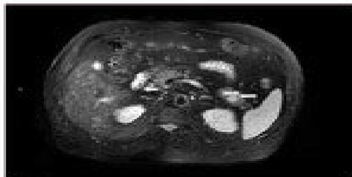
Figure 2 T2 MRI image of abdomen