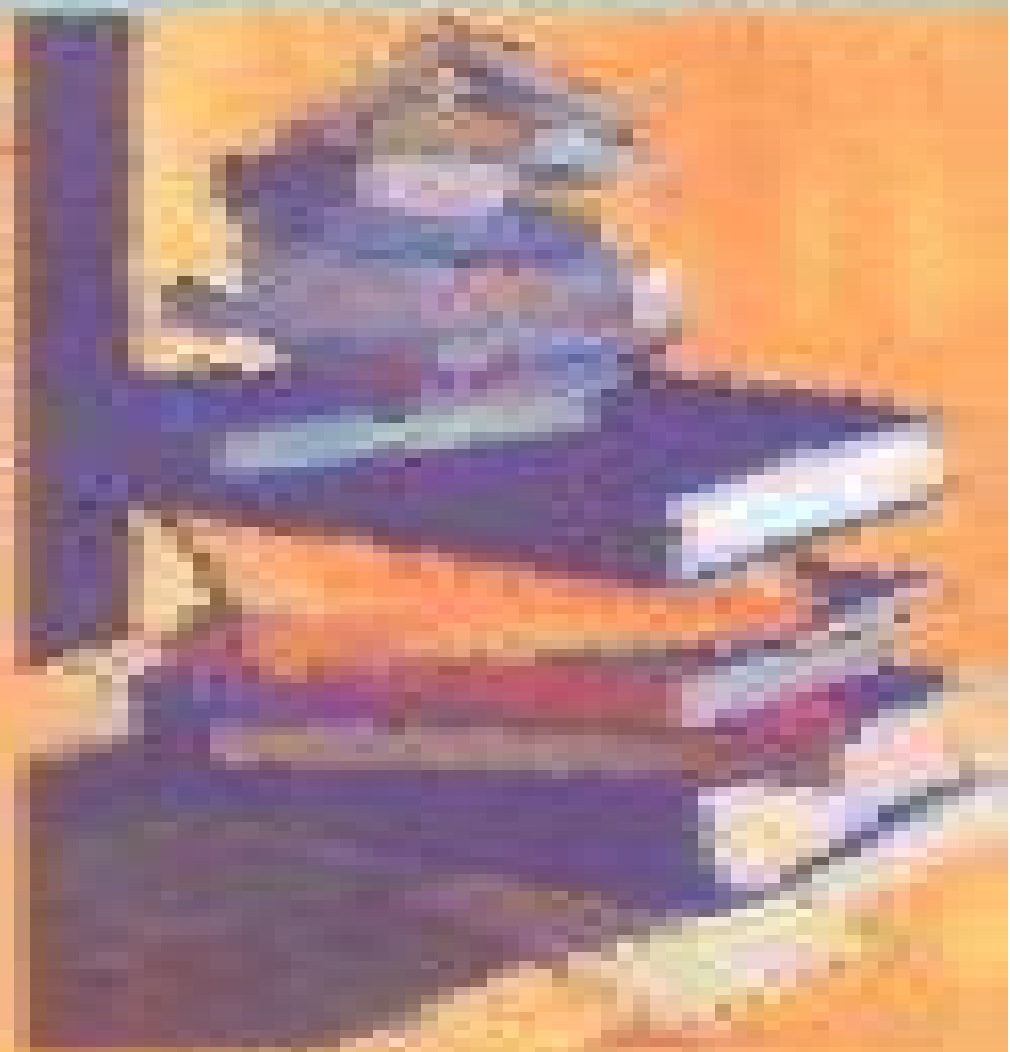
Figure 1. Example of a Learning Library