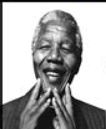
Nelson Mandela 1918-2013