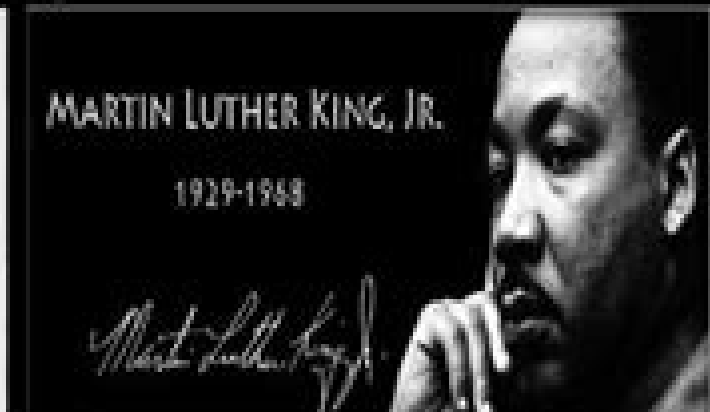
MARTIN LUTHER KING, JR. 1929-1968