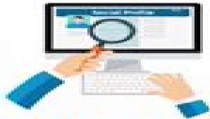
SOCIAL MEDIA MANAGER

Looking to start a small business on the side? Get started with these 10 simple ideas in your spare time. They come with low overhead costs, helping to mitigate