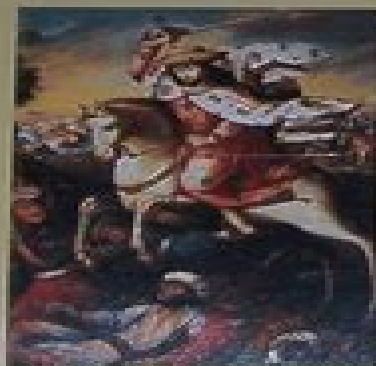
Chivalry, 1960, by J. M. W. Turner