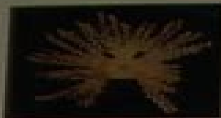
Golden Sunburst, 1960, by J. M. W. Turner