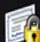
Smart Card Ma...