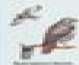
White-throated Sparrow Song Sparrow