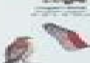
Red-winged Blackbird Cowbird