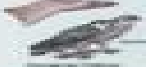
House Finch Starling