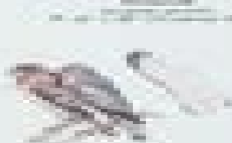
House Finch Junco