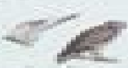
House Finch Starling