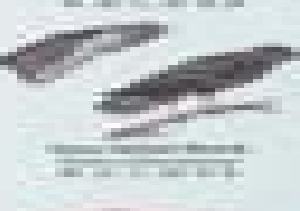
European Starling House Finch