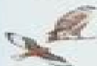
Northern Flicker Downy Woodpecker