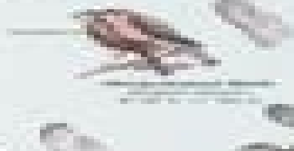
Red-breasted Nuthatch Striped Gnatcatcher