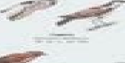
Red-bellied Woodpecker Hairy Woodpecker