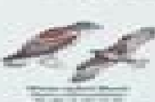
House Sparrow Starling