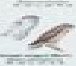
Rock Dove Rock Pigeon