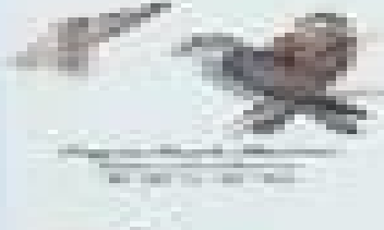
Mourning Dove Pigeon