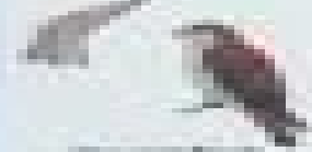
House Finch Starling