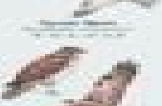
Foxglove Sparrow Field Sparrow