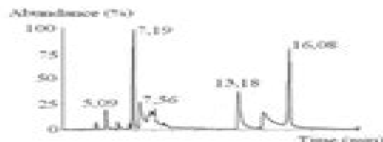
Fig. 1. Representative gas-chromatogram of the sample with standard addition of 40 µl of the stock reference compound mixture

The VOC in a very small amount (15±3 mg) were heated at 150 °C for 4 min. in a septum-sealed vial, after full evaporation, vapour phase was transferred to non-polar capillary column, then determined by gas-chromatographic analysis. Standard volumes of stock mixture were added at four concentration levels (10, 20, 30, 40 µl) to obtain the