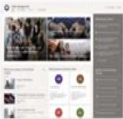
Crisis management Share news, provide support, and connect people to resources in a crisis.