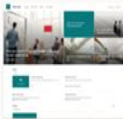
Topic Engage viewers with informative content like news and events.