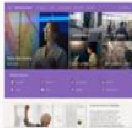
Learning central Provide a landing experience for your organization's learning opportunities.