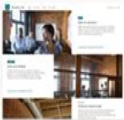
Showcase Spotlight a product, event, or team using visual content.