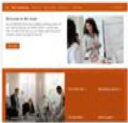
New employee onboarding Guide new employees through your organization's onboarding process.