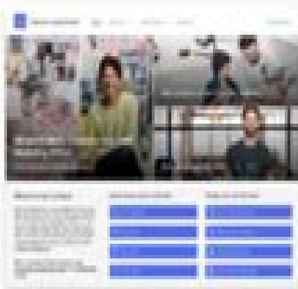
Department Engage viewers with department news, events, and resources.