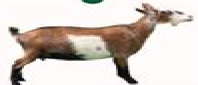
Nigerian Dwarf Goat