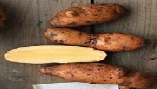
PINK FIR APPLE