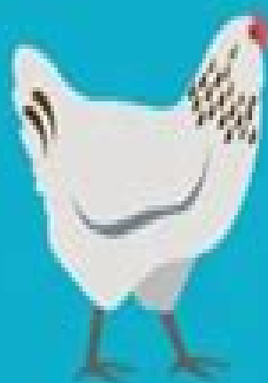
● BLUE WHEATEN