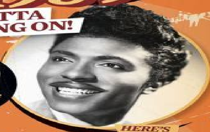
HERE'S LITTLE RICHARD Behind the scenes of a rock'n'roll classic

PAYOLA 1959 The scandal that rocked the music world