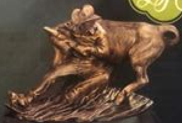
DH 1466 Rodeo Steer Wrestler 10" L $79.98