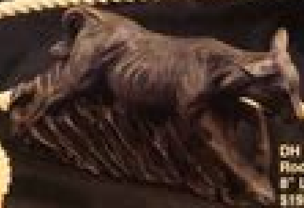
DH 1467 Rodeo Calf 8" L $19.98