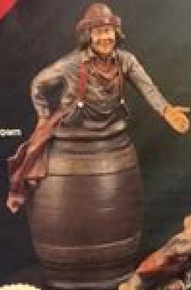
DH 1463 Rodeo Clown 11" T $49.98