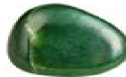
nephrite (green jade)