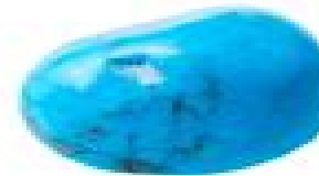
turquoise (blue howlite)