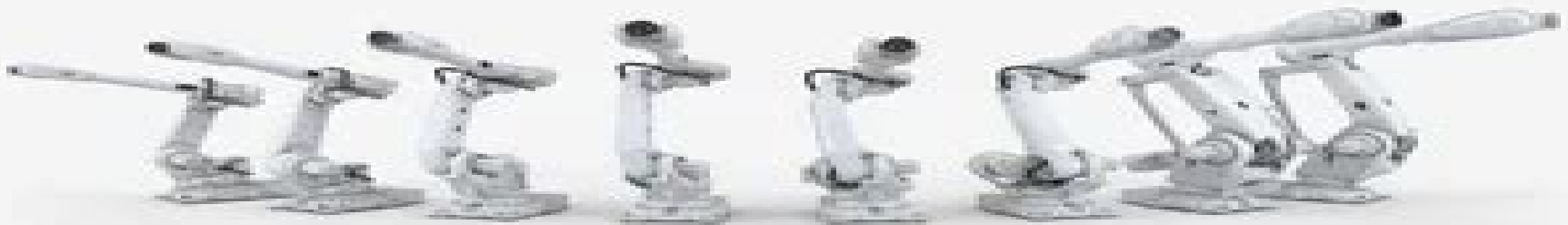
ABB Robotics industrial robots product range