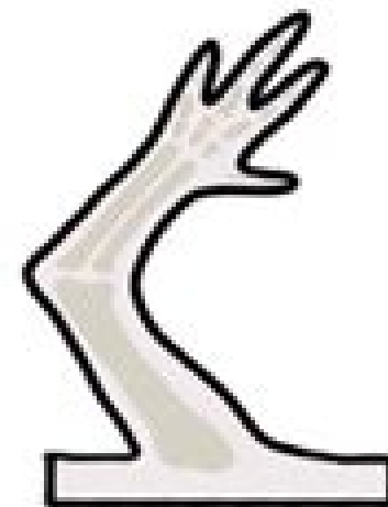
Re-differentiation and redevelopment