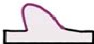
Bud outgrowth and patterning