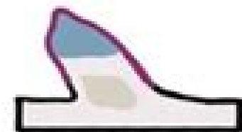
Blastema formation and outgrowth