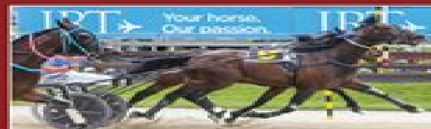
Royal Pride winning over 3200m Cup Day 2022 6 wins | $76,689 to date

Contact: Phoebe Standardbreds 49 Larcombs Road, Broadfield