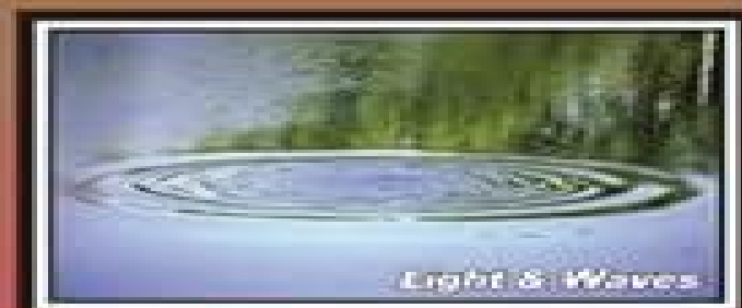
Light & Waves