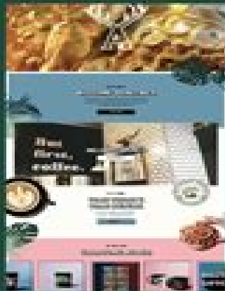
FOOD & DRINK Alfred