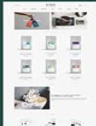
FOOD & DRINK Detour Coffee