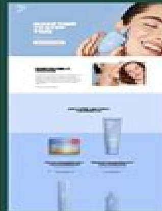
BEAUTY & COSMETICS Them I Met You