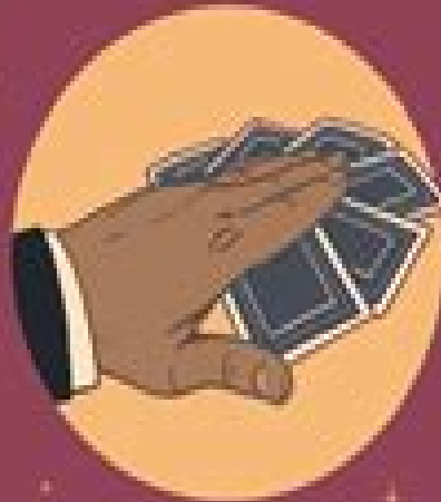
The Magnetic Hand