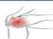
Hip and knee (including OA)