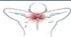
Cervical and thoracic pain

Infographic summary of a systematic review undertaken to identify common recommendations for high-quality care for the most common musculoskeletal pain sites encountered by clinicians in emergency and primary care