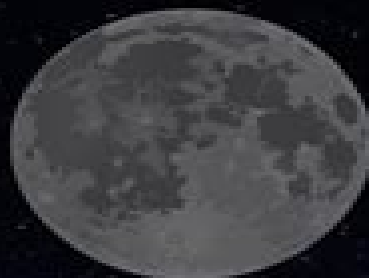
New Moon Day 0, Day 29.5