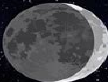
Waxing Crescent Day 3