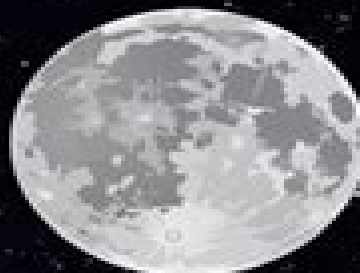
Full Moon Day 13-15