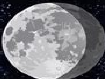
Waning Gibbous Day 18