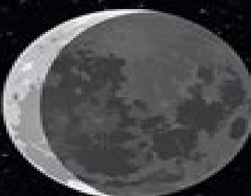
Waning Crescent Day 25