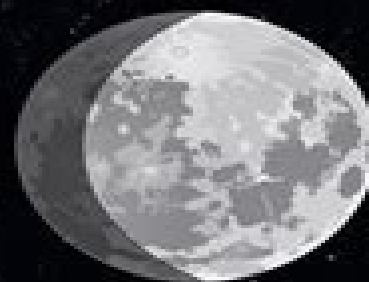
Waxing Gibbous Day 11