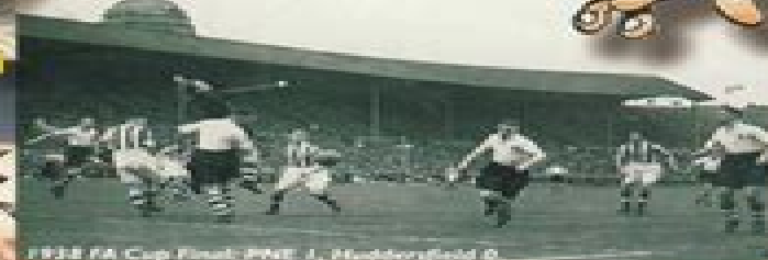
1938 FA Cup Final: PNE v. Huddersfield T.