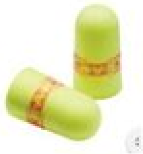
E-A-Rsoft Superfit NRR: 33