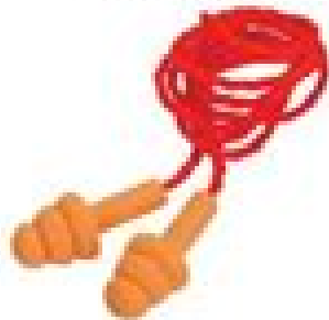
Ultrafit Silicone NRR: 24