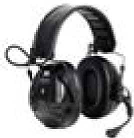
PELTOR WS 100 Headset NRR: 20