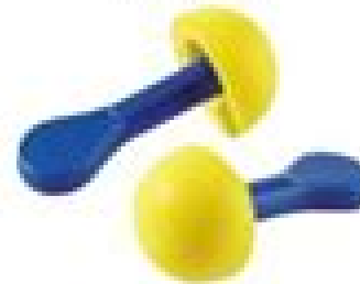
E-A-R Express Plug Pod NRR: 25