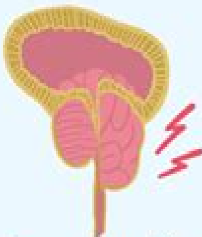
3. Prostate cancer