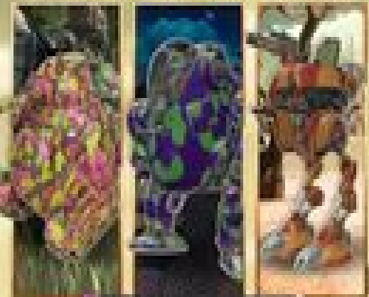
SURVIVALIST CAMO PACK