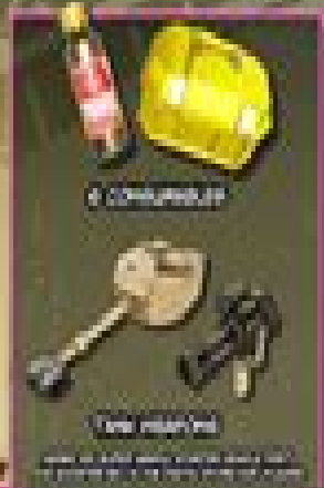
SPEED DEMON PACK