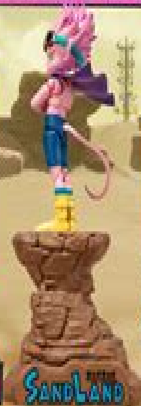
GAME EXCLUSIVE FIGURINE