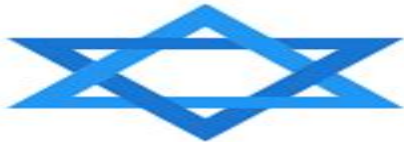
STAR OF DAVID