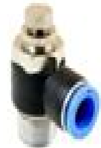
Flow Control Valve