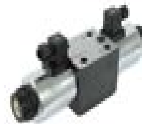
Direction Control Valve