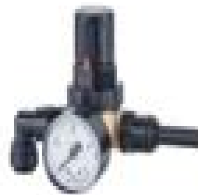
Pressure Regulator Valve