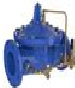
Pressure Reducing Valve