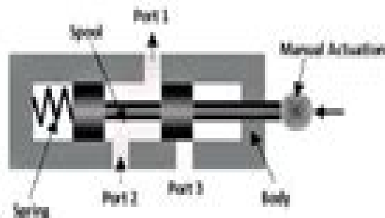
3-way Direction Control Valve