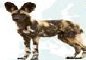
African Wild Dog