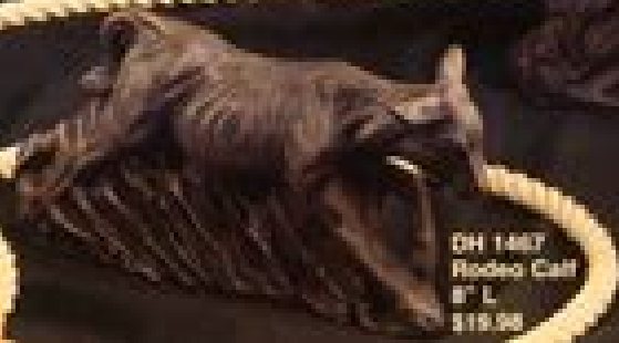
DH 1467 Rodeo Calf 8" L $19.98