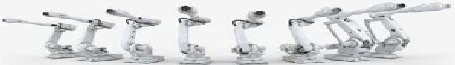
ABB Robotics industrial robots product range