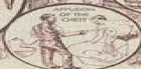
APPLICATION OF THE CLOTH