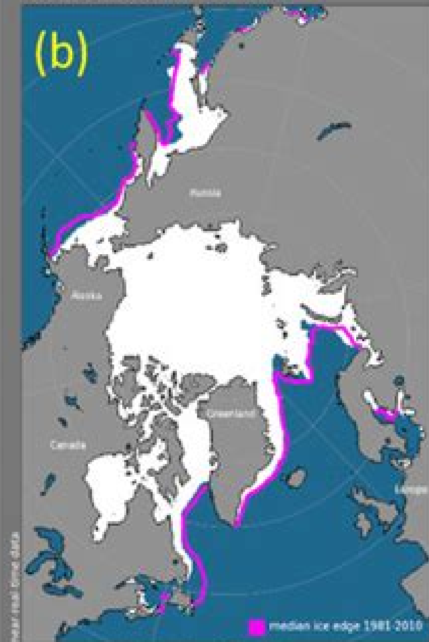
Sea Ice Extent, Feb 2021

National Snow and Ice Data Center, University of Colorado Boulder