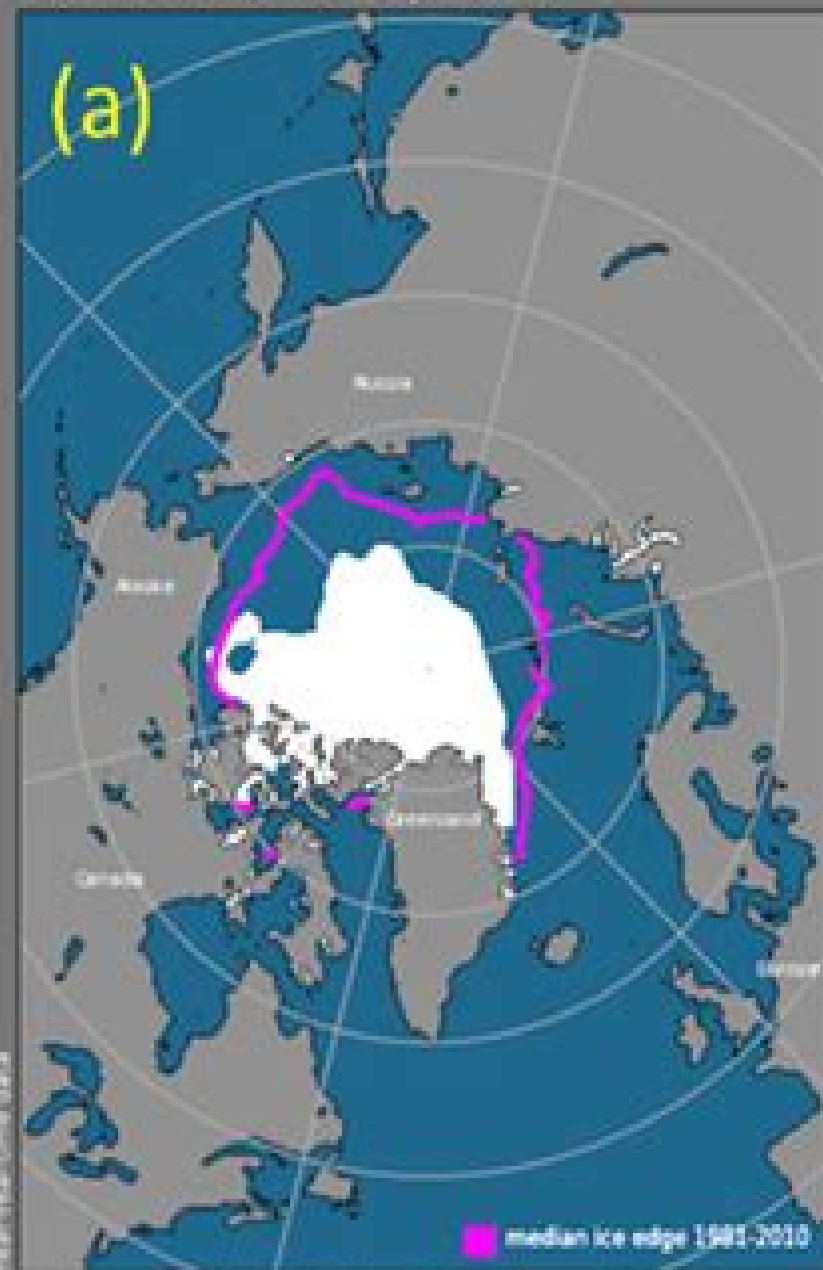
Sea Ice Extent, Sep 2020