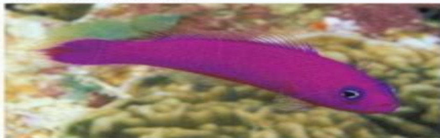
MAGENTA DOTTYBACK Pictichromis porphyrea SIZE: to 6.3 cm (2 1/2 in.) Dottybacks – Pseudochromidae ID: Magenta. Solitary or form small, loosely scattered groups. Base of steep dropoffs or in caves and crevices in steep slopes and coastal and outer reefs in 5 to 40 m, usually below 15 m.

Asian Pacific: N.W. Australia, E. Indonesia, Papua New Guinea and Solomon Is.