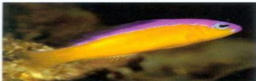
PURPLETOP DOTTYBACK Pictichromis diadema SIZE: to 6.2 cm (2 1/2 in.) Dottybacks – Pseudochromidae ID: Bright yellow to orange with magenta band from snout to end of dorsal fin. Solitary or small groups. Base of cliffs or inside crevices and caves on steep slopes and coastal and seaward reefs in 10-30 m.

Asian Pacific: Brunei, Sabah in Malaysia and Philippines.