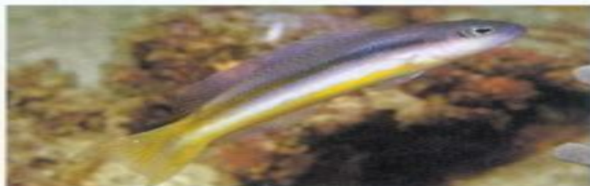
Raja Dottyback – Female ID: Bluish gray upper body, white below; dark gray to yellowish brown stripe from gill cover to tail base, yellow stripe on belly, dark mark behind eye.

West Pacific: S.W. Japan, Indonesia, Philippines, Micronesia, N. Papua New Guinea to Fiji.