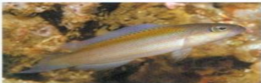
RAJA DOTTYBACK Pseudochromis ammeri SIZE: to 9 cm (3 1/2 in.) Dottybacks – Pseudochromidae ID: Male – Whitish to light gray with bluish gray upper head and yellowish brown back; faint blue spot on most scales and dark mark behind eye (also on female). Solitary. Coral outcroppings on fringing reefs in 10-45 m.

Localized: Known only from Cenderawasih Bay, West Papua in Indonesia.