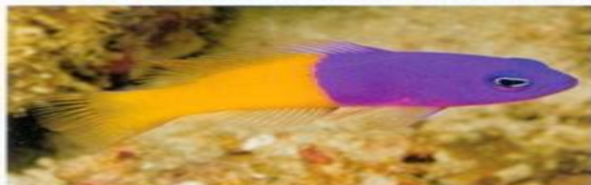
ROYAL DOTTYBACK Pictichromis paccagnellae SIZE: to 5.7 cm (2 1/4 in.) Dottybacks – Pseudochromidae ID: Magenta head and front half of body and yellow to orange rear body. Solitary or form small, scattered groups. Base of steep dropoffs or in caves and recesses on steep slopes and coastal and outer reefs in 5 to 40 m, usually below 15 m.

Localized: Raja Ampat and Fakfak Peninsula in Indonesia.