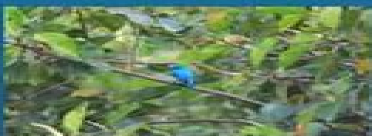
5. PLUM-THROATED COTINGA