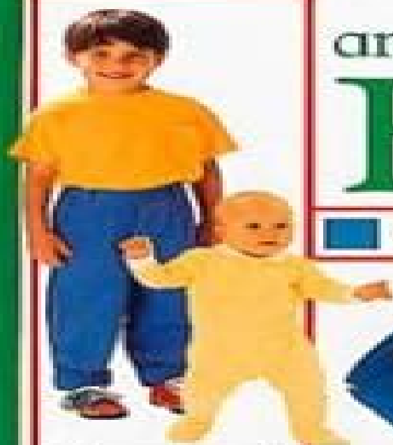
big and small