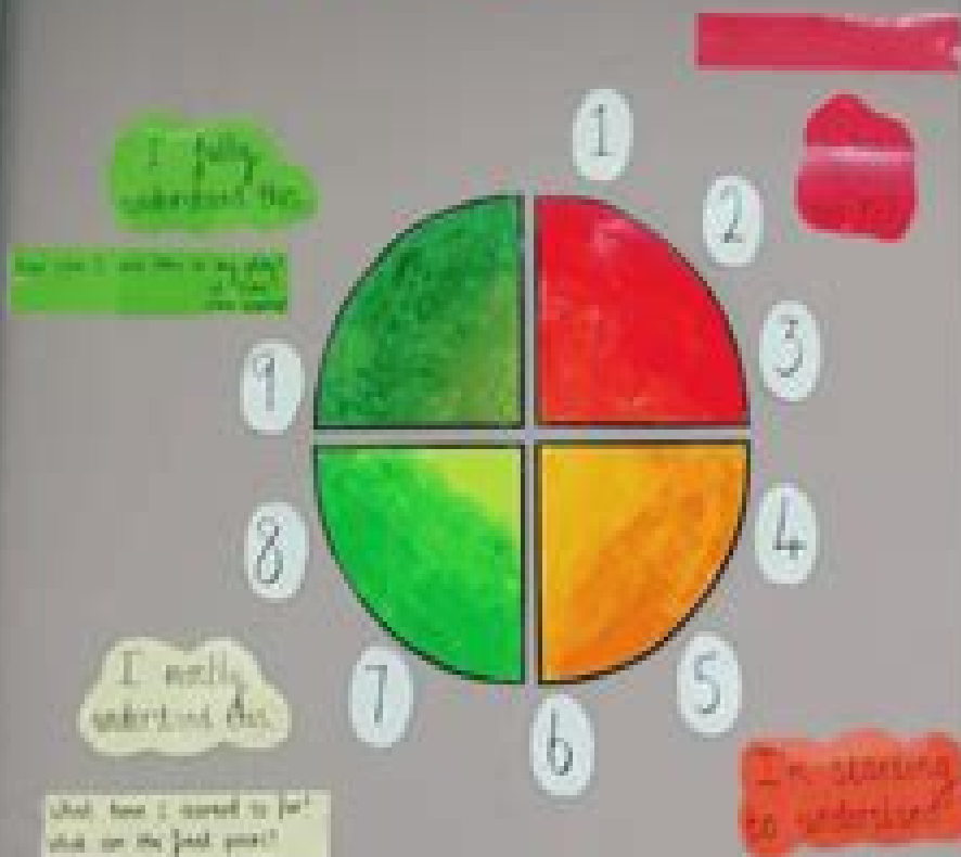
Balance Reflection Wheel