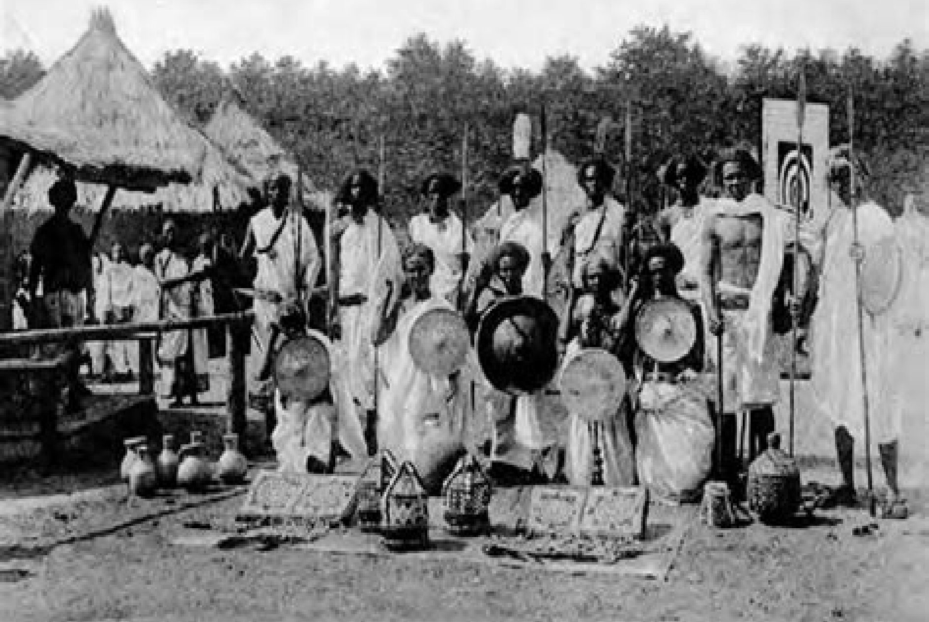
Gewerbe- und Industrie-Ausstellung Schweidnitz. Somali-Dorf.