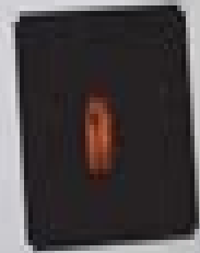
陈羚羊摄影作品集 陈羚羊摄影作品集 陈羚羊摄影作品集