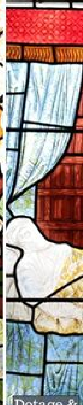
Dotage & Death