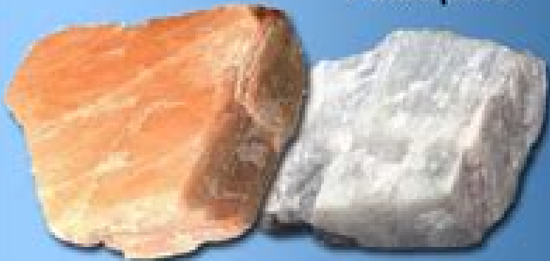
Orthoclase and Plagioclase