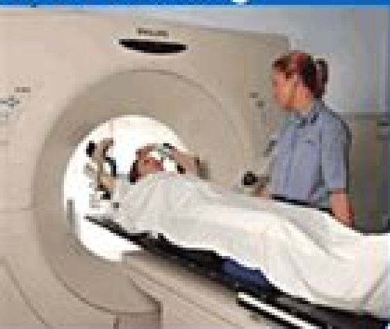
6: Radiotherapy treatment