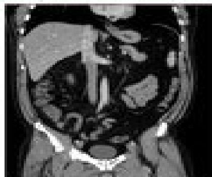
Figure 1 CT coronal image of abdomen

SPECT/CT images of the abdomen demonstrate focal tracer activity, approximately 1.7 cm in the pancreatic tail, corresponding to the finding noted on the recent MRI scan. This SPECT/CT finding is consistent with a splenule in the pancreatic tail.