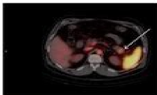
Figure 3 SPECT/CT coronal abdomen image