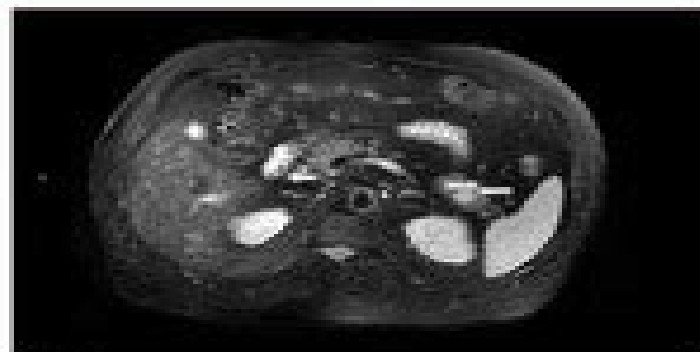
Figure 2 T2 MRI image of abdomen