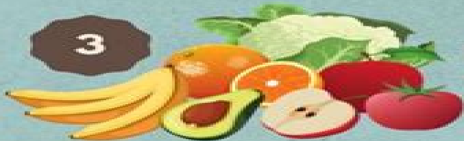
FRUITS & VEGGIES